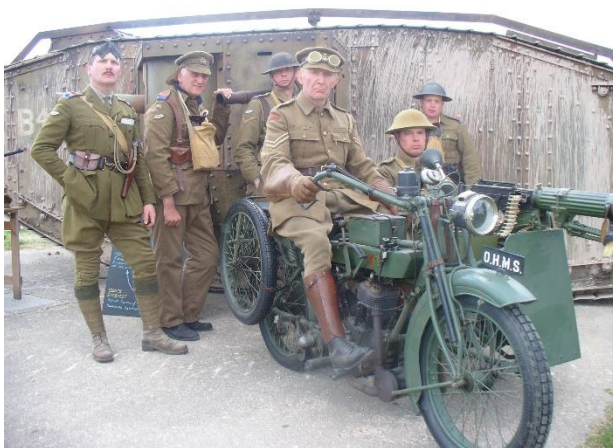
Tank Crew and Machine Gun Corps