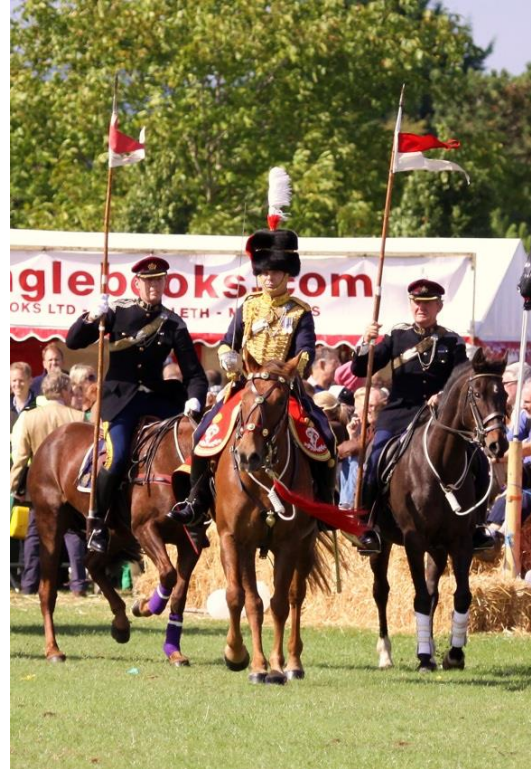
Royal Gloucestershire Hussars

As part of the FRAMPTON REMEMBERS WW1 project, enactments and static displays will be staged at Frampton Country Fair in 2015 and 2016 to cover several aspects of the Great War. They will feature the Army, Navy and Air Force and also the support staff such as Nurses . (Examples shown are from http://www.thegreatwarsociety.com .)