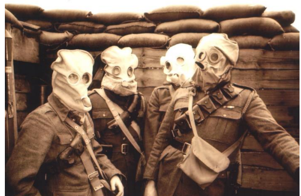
Yeomanry Gas Alert

Frampton Country Fair offers a fantastic opportunity to present the heritage of the Great War to people of all ages in an authentic and interactive way.